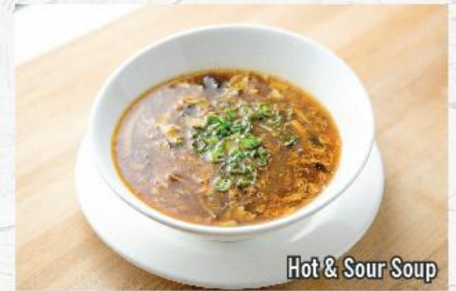
Hot & Sour Soup