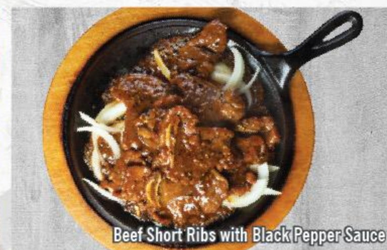
Beef Short Ribs with Black Pepper Sauce