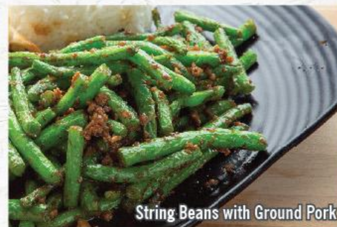
String Beans with Ground Pork