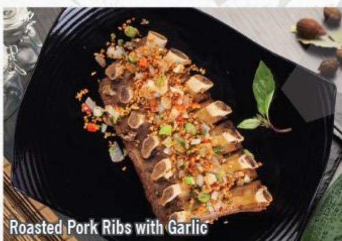
Roasted Pork Ribs with Garlic