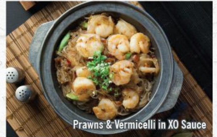
Prawns & Vermicelli in XO Sauce