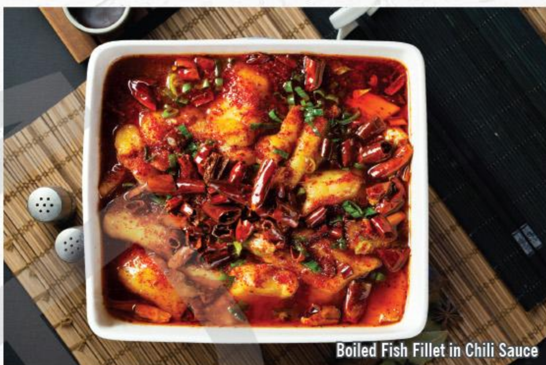
Boiled Fish Fillet in Chili Sauce