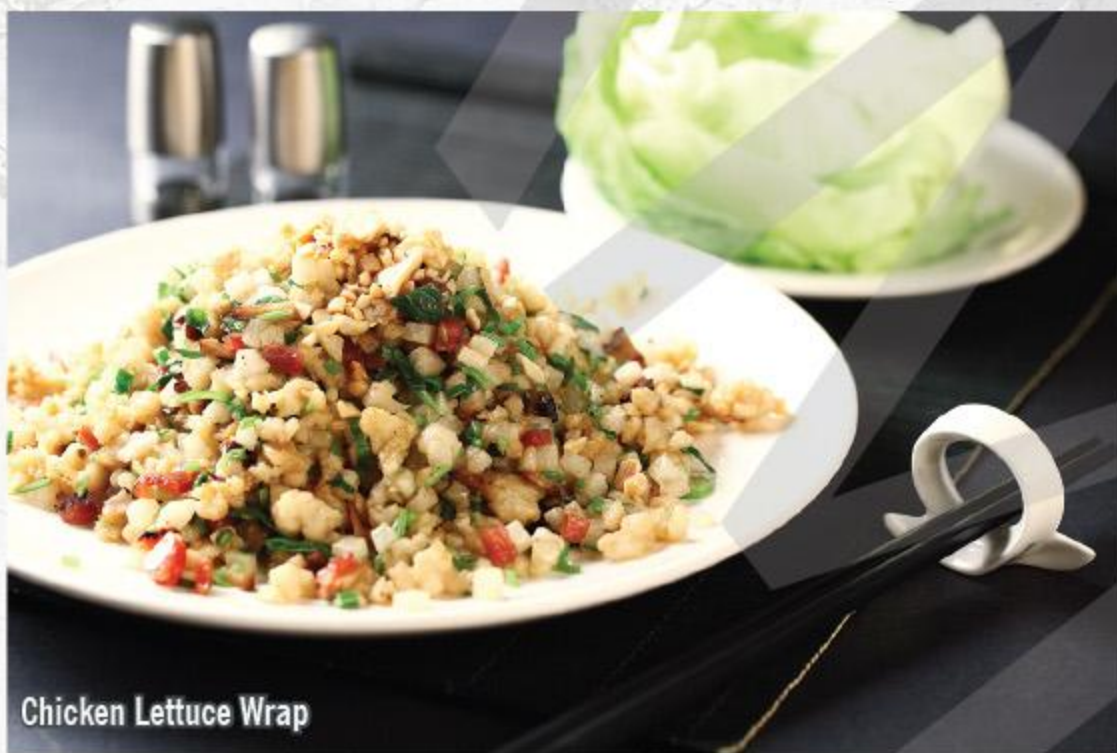
Chicken Lettuce Wrap