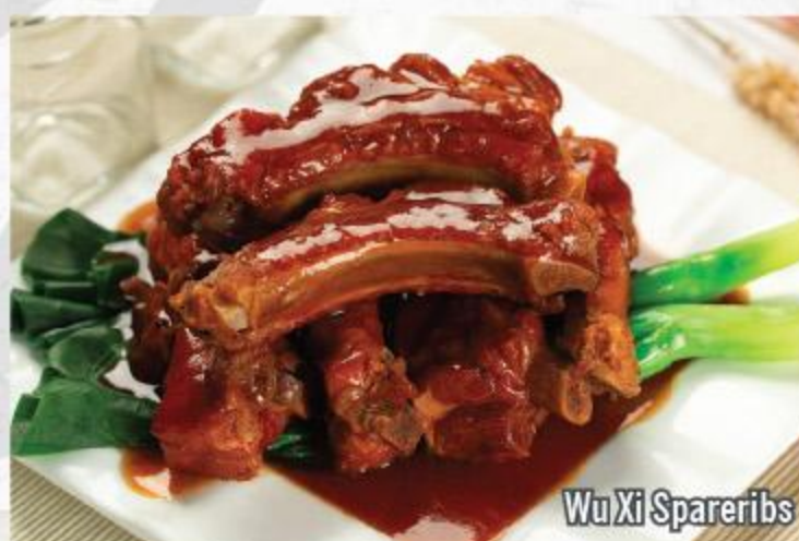
Wu Xi Spareribs