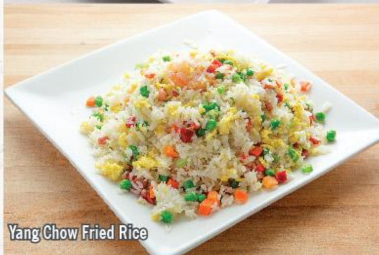
Yang Chow Fried Rice