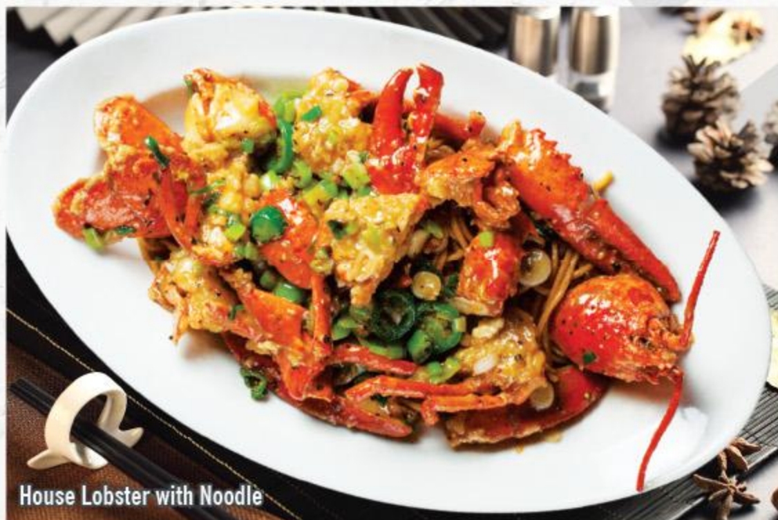
House Lobster with Noodle