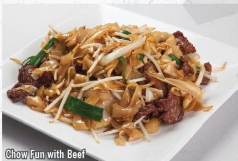
Chow Fun with Beef