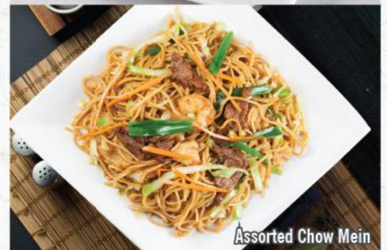
Assorted Chow Mein