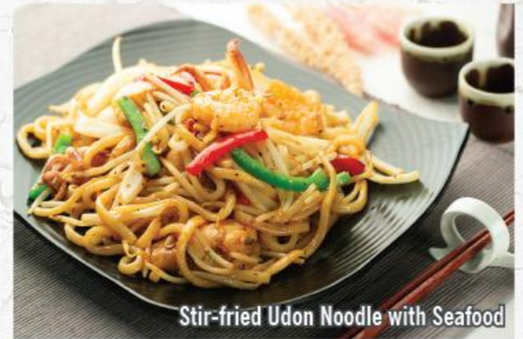
Stir-fried Udon Noodle with Seafood