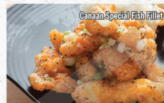
Canaan Special Fish Fillet