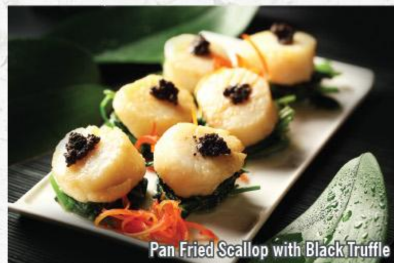
Pan Fried Scallop with Black Truffle