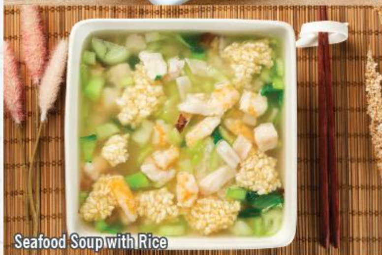
Seafood Soup with Rice

20% Service Charge for parties of 6 or more.