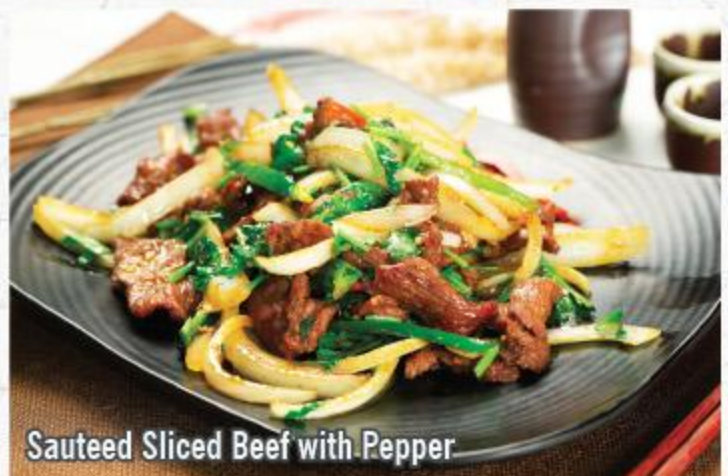
Sauteed Sliced Beef with Pepper