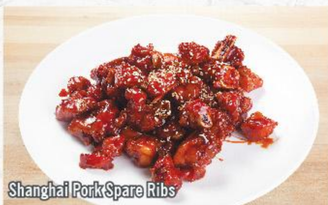
Shanghai Pork Spare Ribs