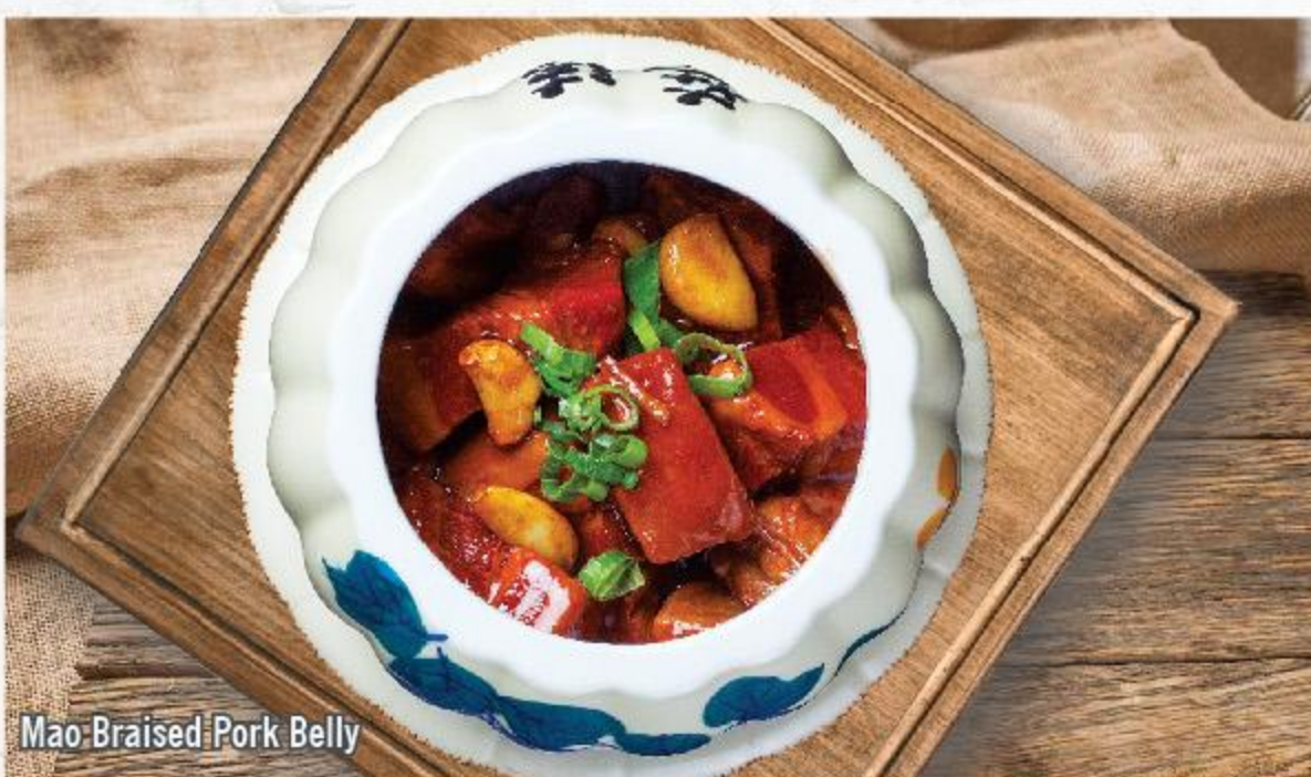
Mao-Braised Pork Belly