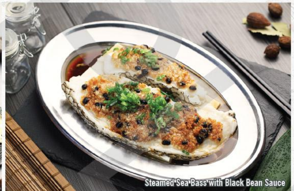
Steamed Sea Bass with Black Bean Sauce