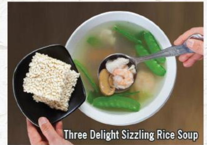
Three Delight Sizzling Rice Soup