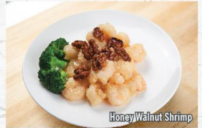
Honey Walnut Shrimp