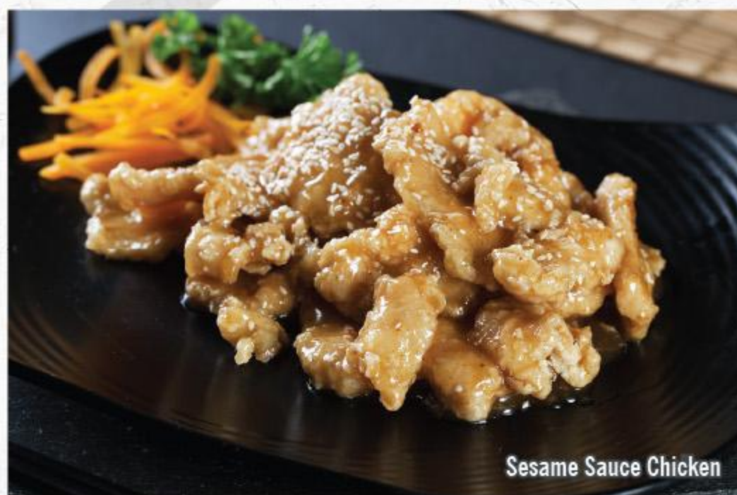
Sesame Sauce Chicken