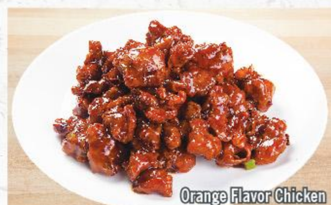
Orange Flavor Chicken