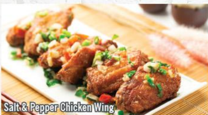
Salt & Pepper Chicken Wing