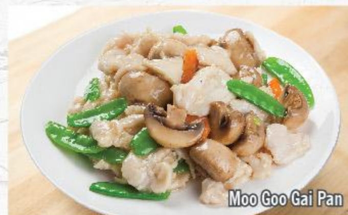
Moo Goo Gai Pan