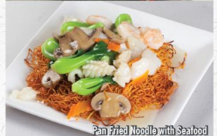
Pan Fried Noodle with Seafood