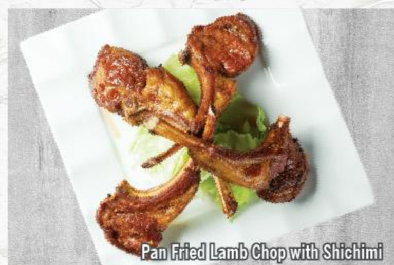
Pan Fried Lamb Chop with Shichimi