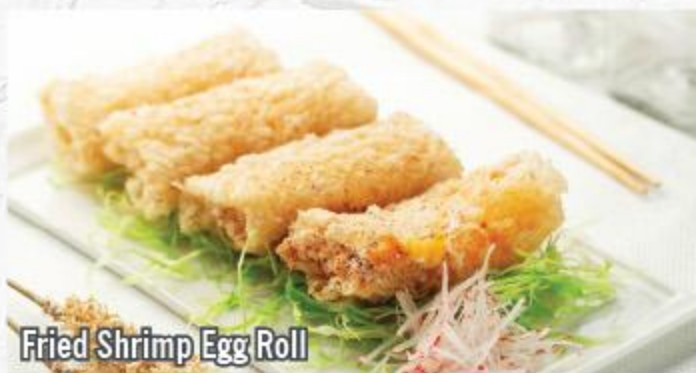
Fried Shrimp Egg Roll