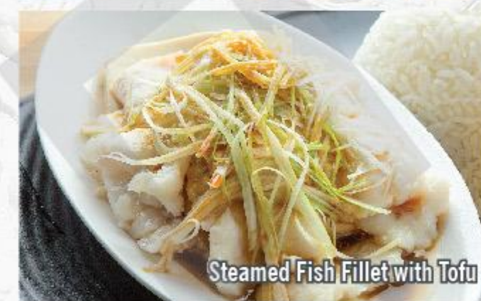
Steamed Fish Fillet with Tofu