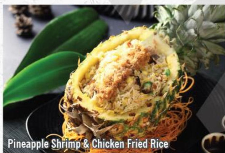
Pineapple Shrimp & Chicken Fried Rice