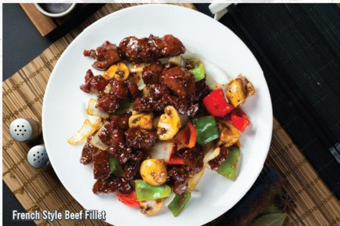
French Style Beef Fillet