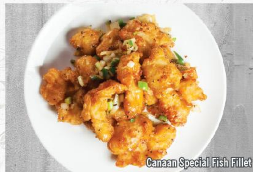
Canaan Special Fish Fillet