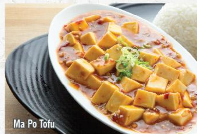
Ma Po Tofu