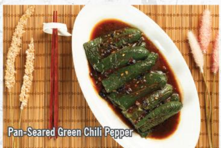
Pan-Seared Green Chili Pepper