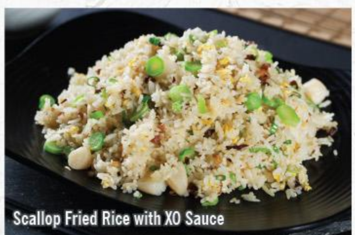
Scallop Fried Rice with XO Sauce