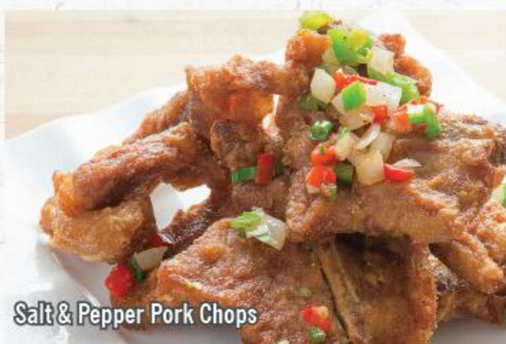
Salt & Pepper Pork Chops