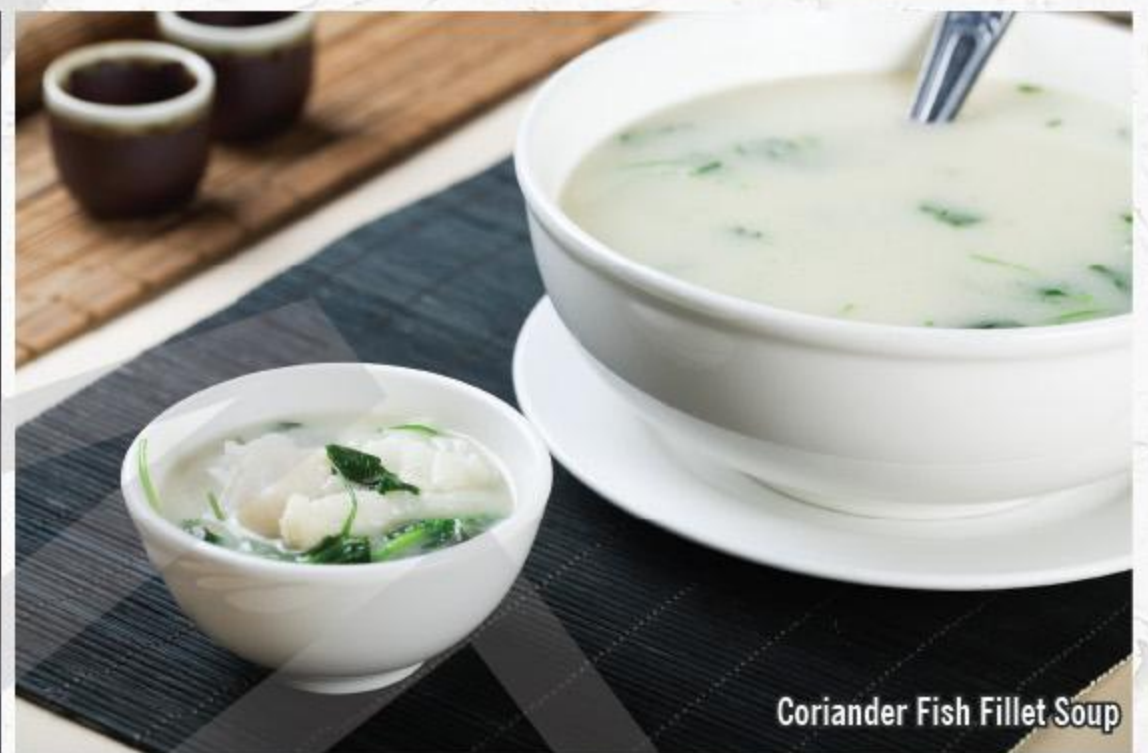
Coriander Fish Fillet Soup