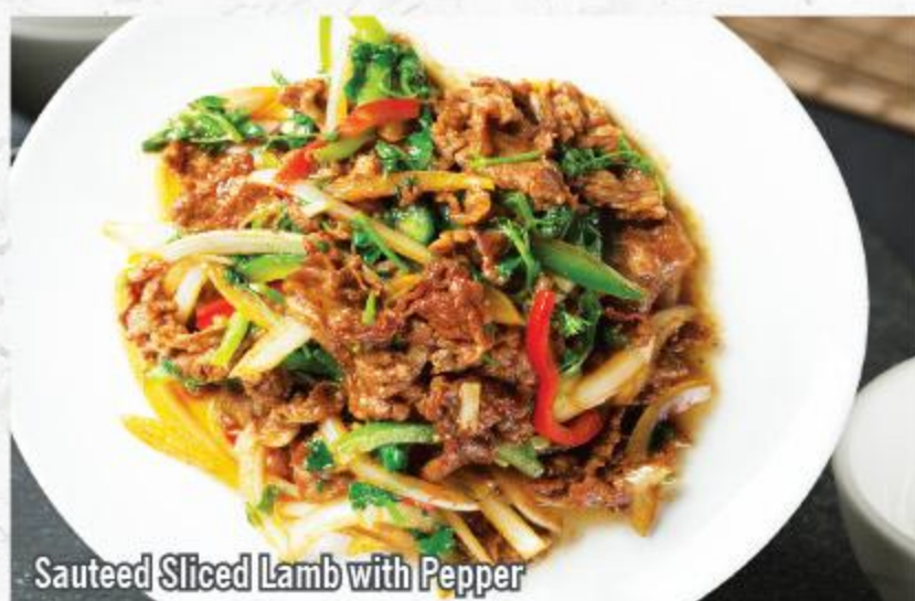
Sauteed Sliced Lamb with Pepper