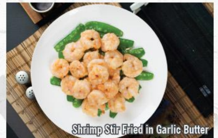
Shrimp Stir Fried in Garlic Butter